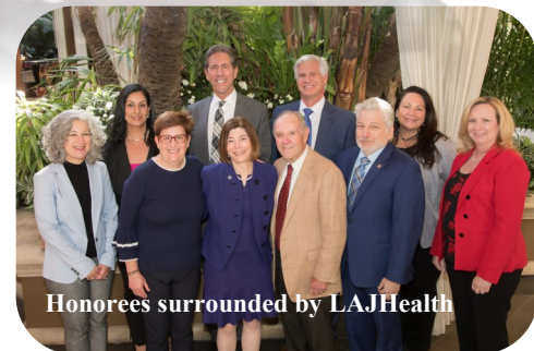
Honorees surrounded by LAJHealth