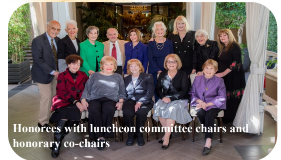
Honorees with luncheon committee chairs and honorary co-chairs