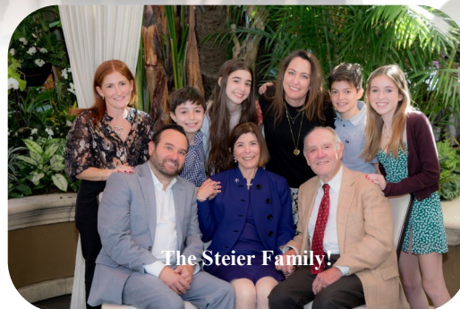
The Steier Family!